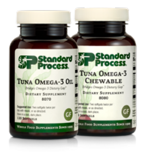
Tuna Omega-3 Oil or Tuna Omega-3 Chewable: Delivers essential omega-3 fatty acids*

Whey Pro Complete: Supplies 15 grams of protein per serving to support weight management, muscle tissue, immune system response function, and gastrointestinal health*